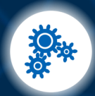
And Much More!